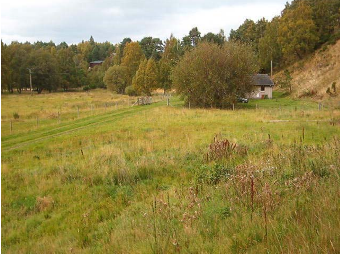
Fig. 2 Development site in fore-ground

1. The site is located just to the south of the Lagganlia Outdoor Education Centre in Glen Feshie. The site sits on a flat piece of ground below an embankment immediately to the south of a bungalow known as Tigh an Tearlach. The site is close to the confluence of the Allt a Mharcaid with the River Feshie and the unmade track, which accesses the existing bungalow, runs alongside the burn. This track would be used to access the proposal site.